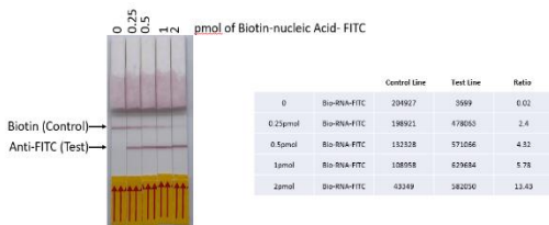
Figure 2. This data demonstrates the importance of the relative amounts of molecules of a synthetic duel labeled oligo (containing biotin and FAM) with the amount of gold particles to finding optimal line intensities. Biotin line captures streptavidin reporter-particles when streptavidin is not occupied with the duel labeled oligo. The more duel labeled oligo added, the binding to the anti-FITC/FAM reaches maximal intensity at 1pmol and then diminishes due to over saturation with the duel labeled oligo above 4 pmoles, free biotinylated oligo overtakes the system to bind both the streptavidin gold and anti-FITC/FAM while also occupying every gold particle in the system leading to a loss in intensity of both the biotin line and the anti-FITC/FAM line also called the “hook effect” (data not shown).

you add more biotin labeled nucleic acid product into the reaction the less control line is visualized. Therefore, a comparison of the sample should be made with a strip containing only sample running buffer in each experiment. The appropriate concentration of labeled nucleic acid to use with strips is dependent upon the purity and sequence of the nucleic acid and a standard curve can be used to determine the relative ratio. A positive control duel labeled (biotin-FITC/FAM, biotin-dig, or biotin-DNP) nucleic acid of your sequence that has a well characterized size, purity and concentration can be used for comparison.